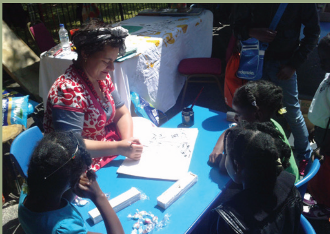
People came together to design and make all the artworks and features for the garden. We used the derelict space and the Children's Centre.