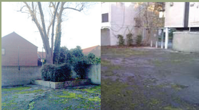
This was the site in South London before work began. It had long been a neglected corner of the housing estate